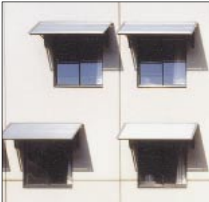
Honed reconstructed stone finished panels with staggered window layout

The flooring system between the precast walls is provided by a NPCAA Member. Further, the conventional reinforced concrete floors that were to be used in four of the other buildings were changed to the speedily erected precast flooring system in order to make gains in the construction program. In this way only four of the ten buildings on site were constructed without using precast concrete. Multiplex did, however, incorporate timber framing into these – again using off-site manufacture.