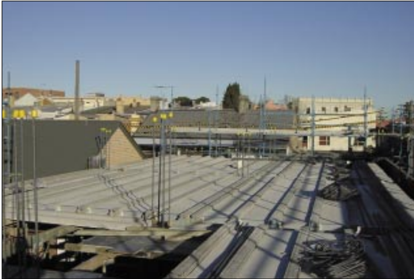
Precast deck forming floor of Village building prior to mesh placement