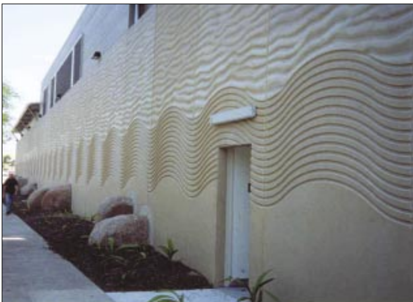
Tidal Wall formed by precast coloured acid-washed 6m high panels and sculptured boulders

The structure comprised a series of 850 mm depth prestressed inverted T beams at 7.2 metre centres, projecting from the creek bank, supported on two rows of driven piles. In the outdoor areas, transverse precast concrete bearers spanned between these main girders at approximately 4 metre centres. Internally, precast planks spanned between the girders. The upper 260 mm section of the girders in this section was poured insitu, tying the structure together, protecting the ends of the precast planks and providing design continuity in the slabs.