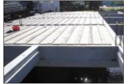
850mm depth inverted T-beam and infill panels forming the deck of the Riverwalk

The northern Riverwalk area extends about 130 metres along the creek and comprises