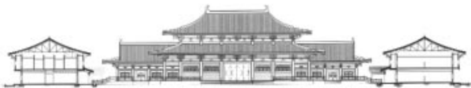
Drawing showing elevation of Temple

The temple has such a striking visual impact, it is intended to be used as an approach marker by the local aeroclub. ■