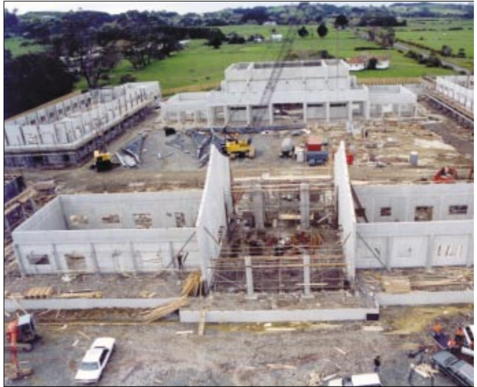
Installation of precast wall panels in main temple building and side halls

The architectural specification required an off-form finish for the exterior concrete panels with cast-in rebates to provide