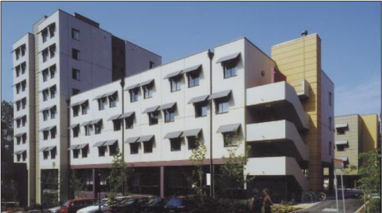
Accommodation building in new Student Village, University of Sydney.

WEB ADDRESS: www.npcaa.com.au • EMAIL: info@npcaa.com.au