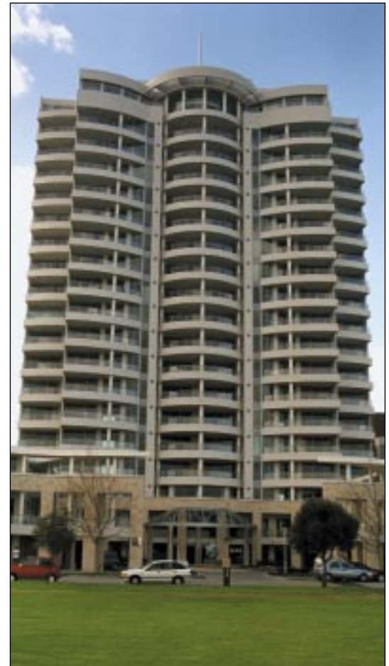
Perth's 18-storey Panorama Apartment complex - the largest totally precast structure in WA