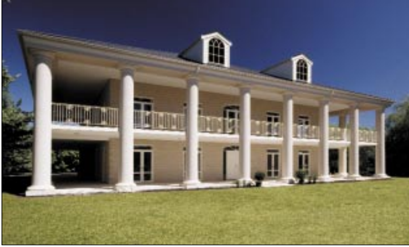
Capulec Centre in Rockhampton featuring 10m precast column shells