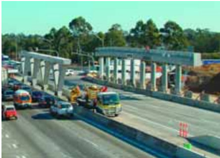
Precast substructure - ready for girders