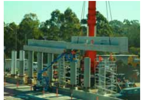
Erection of abutment headstocks.

Minimum section size, tapered edges and fluted faces have been incorporated with a very high class finish into the Y-columns with striking effect. Together with their tapered W-shaped headstocks, the Y-columns present a superb structural image, particularly at night where