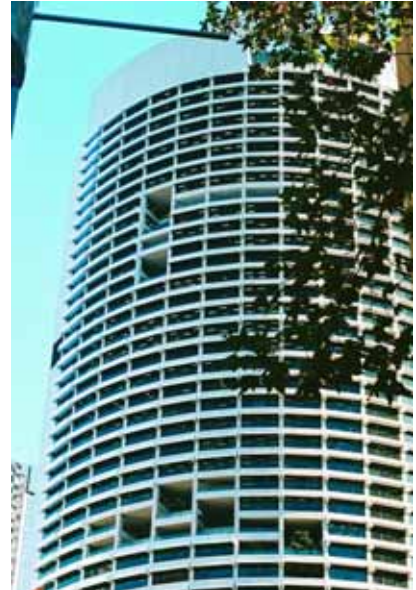
Fig 4. Grosvenor Place, Sydney: a facade of low sensitivity.