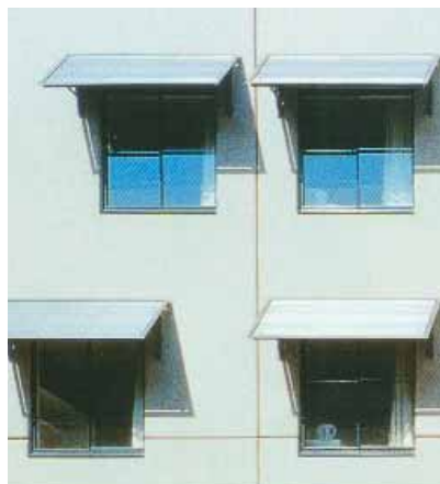
Fig. 5. Precast wall with shaded windows: low sensitivity.

There is absolute certainty in any air-conditioned building that greenhouse gas abatement would be achieved by shading any type of glass whether it be clear or the best of so-called "high performance glass."