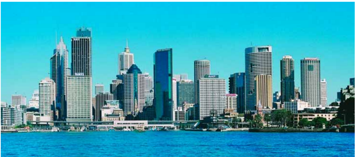
Figure 1. Sydney building facades have various thermal sensitivities. The least sensitive have concrete or GRC facades with shaded windows. Some of the more sensitive unshaded fully glazed facades have low energy star ratings and could become unleaseable if a minimum energy rating of 3 stars were required by prospective tenants.

Reduction in electricity consumption would achieve more greenhouse gas abatement in Victoria than in NSW. Very little abatement would accrue from reducing electricity consumption in Tasmania. Abatement in the Northern Territory would be only about 65% of that in NSW.