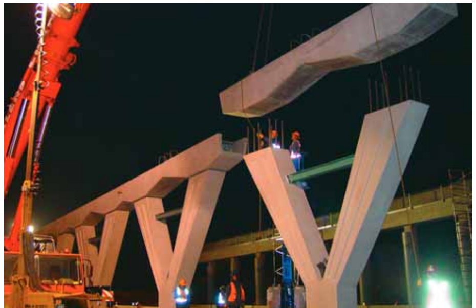
Precast headstocks being erected on Y-shape pier columns

The recently completed Moorebank Interchange has removed the last remaining set of traffic lights on the main highway link between Sydney and Albury. Motorists can now travel from the north side of Sydney Harbour via the Sydney Harbour Tunnel, the Eastern Distributor, the M5 East and M5 motorways and the Hume Highway unimpeded to Canberra and the Victorian border.