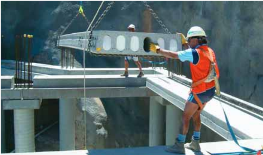
Hollowcore planks deliver strength and fire rating with up to 45% less material plus savings in structure dead load and transport costs.

It has not been too fashionable within the construction industry to look for building techniques that minimise the use of raw materials and energy. Concepts such as sustainable development, intergenerational equity and the precautionary principal have had scant exposure. Instead, the construction industry has been focussed pretty exclusively on making money. Adversarial contracts too often dictate that the only important criteria is finishing on schedule and to hell with the collateral damage to the quality of the building or to the future environment.