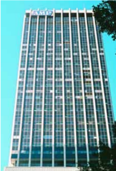
Fig. 2. 50 Bridge Street, Sydney: a highly sensitive facade.