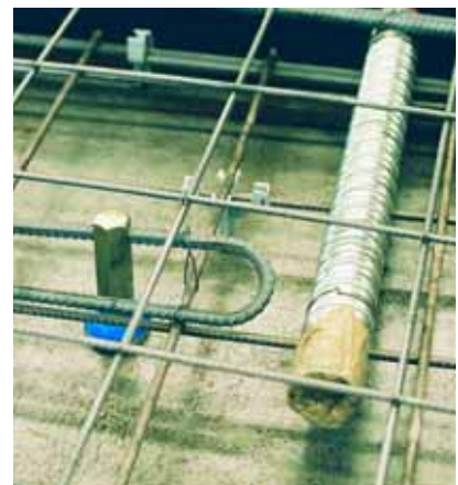
Fig. 6. Cast-in fixings for on-site attachment of light-weight shades.

Also heritage-listed, Seidler's cylindrical Australia Square Tower is unlikely to have its shading increased. The radial projecting columns provide only partial shading.