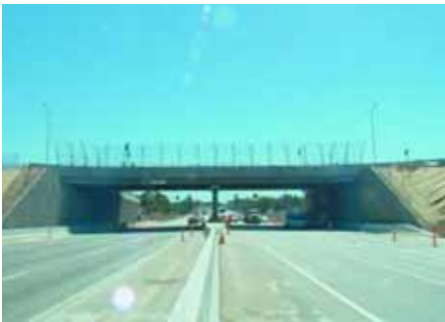
The completed interchange.

In using precast, the two span portal structure was designed with fixity at the base of the abutment and pier columns so as to be totally freestanding and without reliance on the adjacent civil works. This independence of structure allowed significant construction planning freedom, particularly in respect of efficient use of resources.