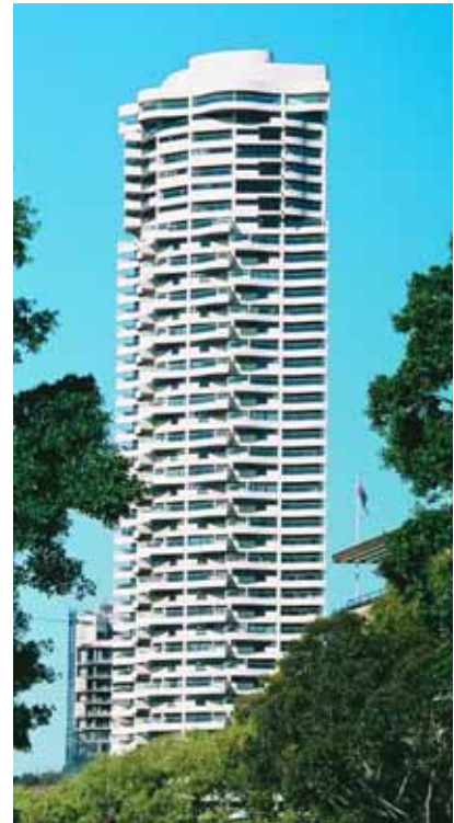
Fig 8. Horizon Apartments.

Research and development should be undertaken to produce shading systems at low cost and with low embodied energy.