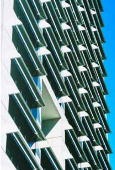
Fig 7. Shades on IBM Building