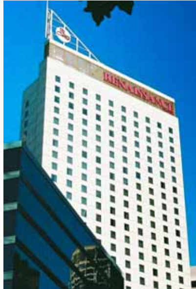
Fig 3. Renaissance Hotel, Sydney: a sensitive facade.