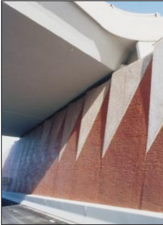
Patterned precast retaining wall units on Melbourne Freeway project using 7.6% deep marigold oxide