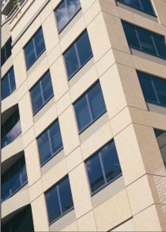
High-rise office building clad with high-quality polished facade panels providing Class 2 finish – the best the precast industry can produce