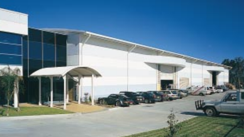
All precast concrete facades can be painted as these hollowcore wall panels have been